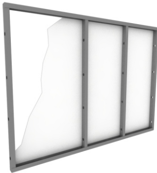
STEP 1 - Plasterboard of the other side of the Framing.