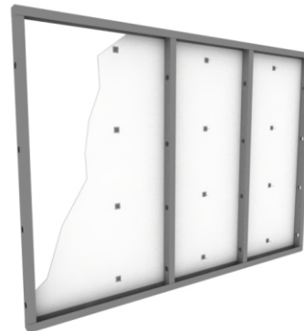
Step 2 - Installation of Drytech Insulation clip with the help of GI Staples as per Requirement